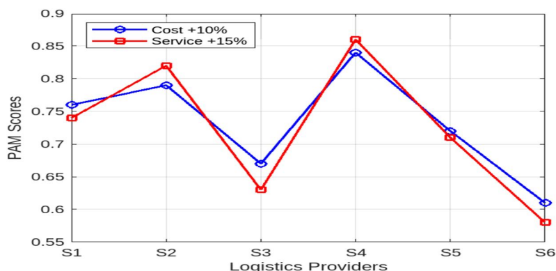
Fig 1. Sensitivity Analysis Results for Cost and Service Weight Variations

To test the robustness of the results, a sensitivity analysis is performed by varying the weights of the criteria and observing the changes in the rankings of the providers. For example, when the weight of cost (K1) is increased by 10%, the rankings remain largely consistent, with S4 maintaining its position as the top-ranked provider. However, when the weight of services (K2) is increased by 15%, S2's ranking improves slightly, moving it closer to S4.