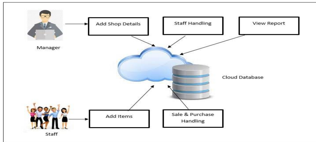
Figure 1: System overview

The presented technique for the purpose of achieving ERP or Enterprise Resource Planning scheme has been depicted in the figure 1 above. The presented approach consists of various actors and the tasks which are performed by these actors are detailed in the steps given below.