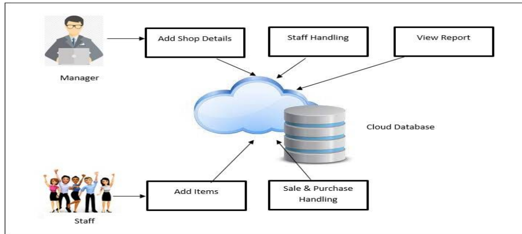
Figure 1: System overview

The presented technique for the purpose of achieving ERP or Enterprise Resource Planning scheme has been depicted in the figure 1 above. The presented approach consists of various actors and the tasks which are performed by these actors are detailed in the steps given below.