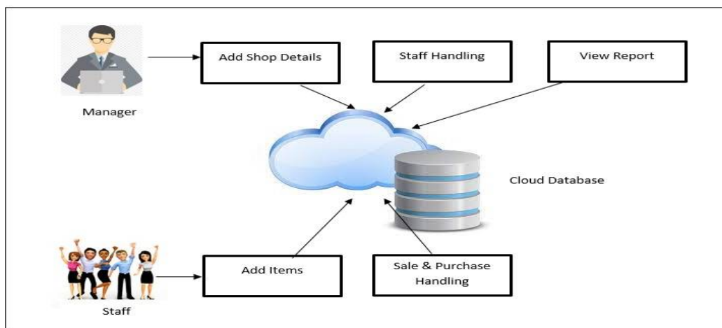
Figure 1: System overview

The presented technique for the purpose of achieving ERP or Enterprise Resource Planning scheme has been depicted in the figure 1 above. The presented approach consists of various actors and the tasks which are performed by these actors are detailed in the steps given below.