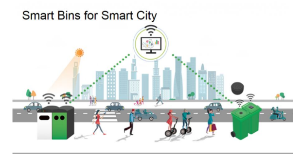
Figure 5: Smart Bins

1) Smart Waste Bins: When left to their own devices, people don't always bother to sort their waste into proper waste or recycling bins. To help reduce improper recycling sorting. Polish company Bin-e designed a smart waste bin that uses artificial intelligence based objects recognition to automatically sort recyclables into separate compartments. After sorting, the machine compresses the waste and monitors how full each bin is. Smart waste bins take human error out of the initial sorting process, making material processing faster and easier for recycling facilities. This can lower waste management costs by as much 80% and drastically improve employee efficiency.