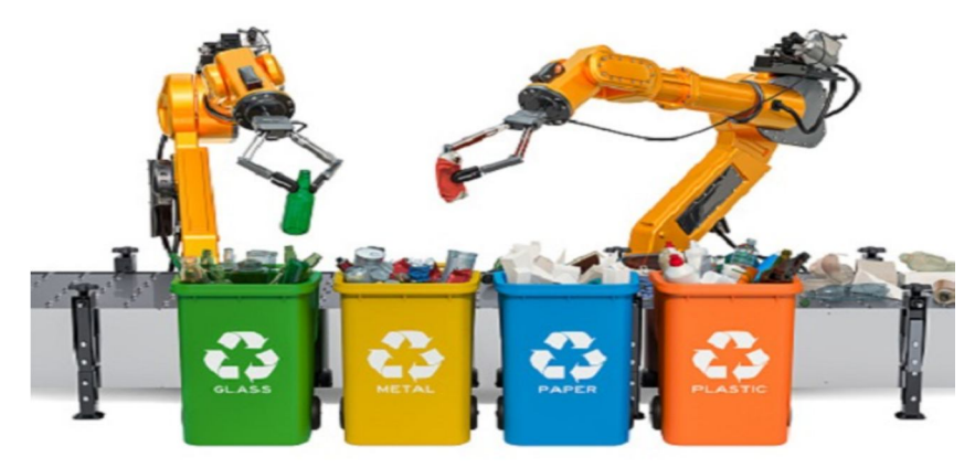
Figure 6: AI Recycling Robots

Fortunately, recycling robots powered by artificial intelligence (AI) can help pick up some of the slack. These robots are designed to accurately identify and sort recyclable materials, increasing efficiency and reducing the need for human workers. This is not only saves recycling centers money over time, but also helps divert materials that would otherwise end up in landfills.