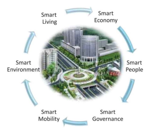
Figure 1: Development of smart city

Keywords: 5G network, Internet of things (IOT), Smart Waste Management System, Safety and Security, Sustainable.