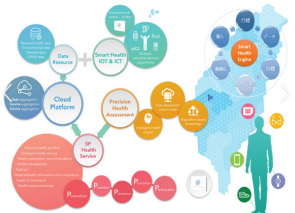
Figure 4: IOT in healthcare to be worth $409.9 Billion by 2022 Much of the connections to be supported by 5G.