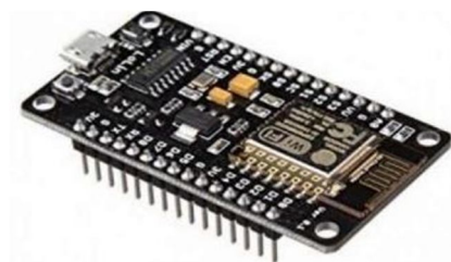
Fig 5.1.3 Node MCU