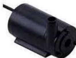
Fig5.1.5 Water Pump