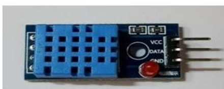
Fig 5.1.2 DHT 11 3.2