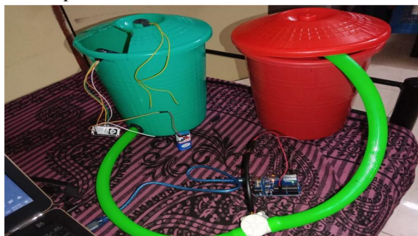
Fig. 2 Experimental Set Up

The flow rate of water while carrying out the experiment was observed to be in between 500 – 1360 litres/hour as shown in Fig. 3.