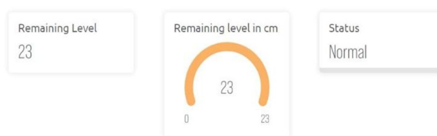
Fig.4 Water Level and Status visualized on Blynk App