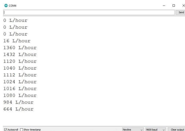
Fig. 3 Flow Rate Observation on Serial Monitor