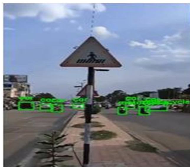
Fig. 3 Vehicle and object detection