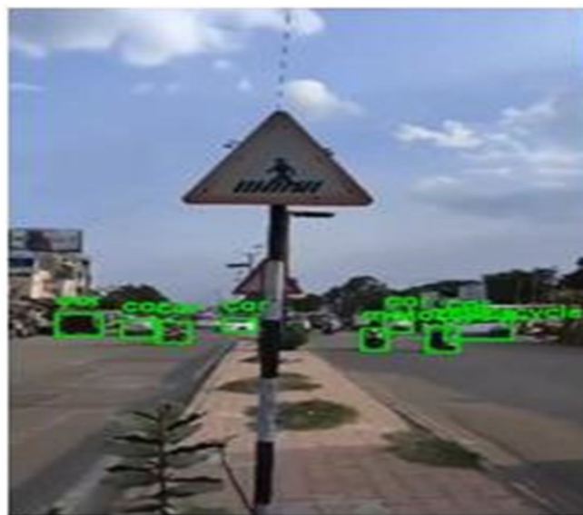
Fig. 3 Vehicle and object detection