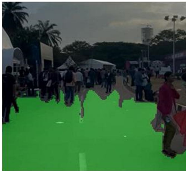
Fig. 2 Navigable path detection

The project successfully integrated advanced machine learning and real-time image processing to create a portable, user-friendly navigation aid for the visually impaired. The tool increases user safety and independence by providing clear and intuitive information using state-of-the-art search algorithms. Feedback from test users is important to complete the work of the device to be transferred to the real site. Future improvements may include more real-time and advanced predictive analytics to support more recommendations. Overall, the project sets a new standard for service technology and demonstrates the enormous impact that combining technology with user-friendly design can have on blind people.