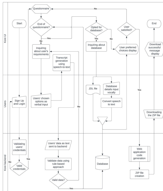
Figure 1. Kore flow chart

The various swim lanes displayed in Figure 1 demonstrate the distinguished responsibilities of the entities present. Figure 1 exhibits the segregated activities corresponding to the users, Kore UI, and Kore backend.