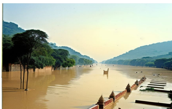
Image 1: Royal Palace of Hastinapur submerged in the flood in Ganges during the reign of King Nichakshu