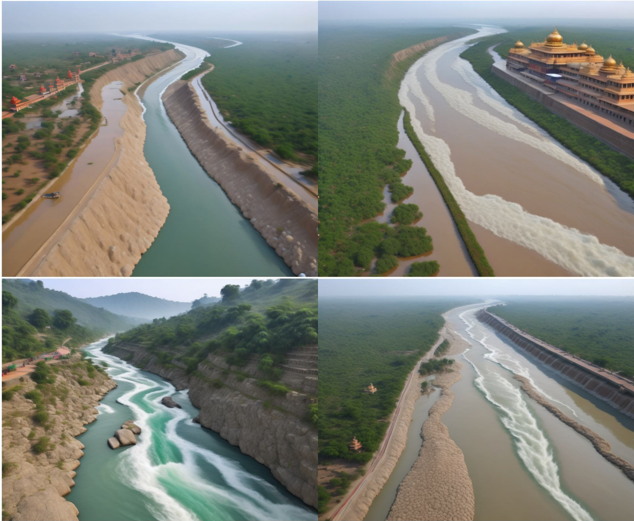
Image 4 : In Mahabharat Era, there was a picturesque view of River Ganga (now Budhi Ganga) in and after Hastinapur.