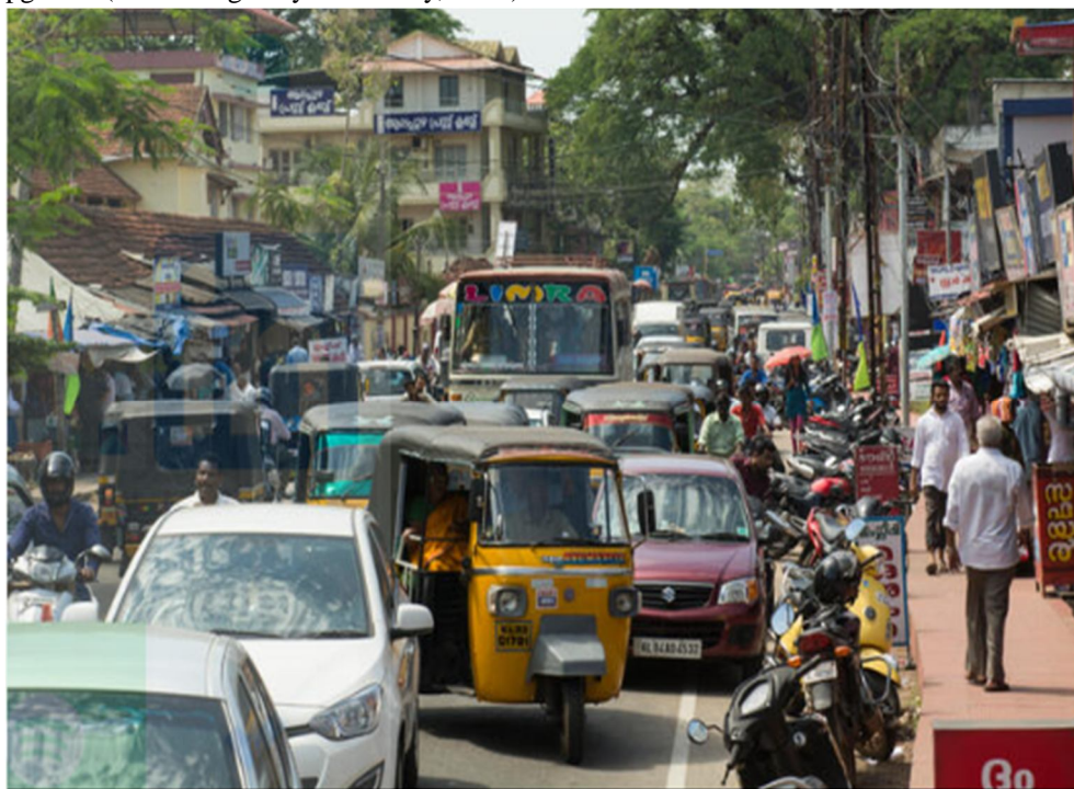
Fig. 1: Two-Lane National Highway in Kerala