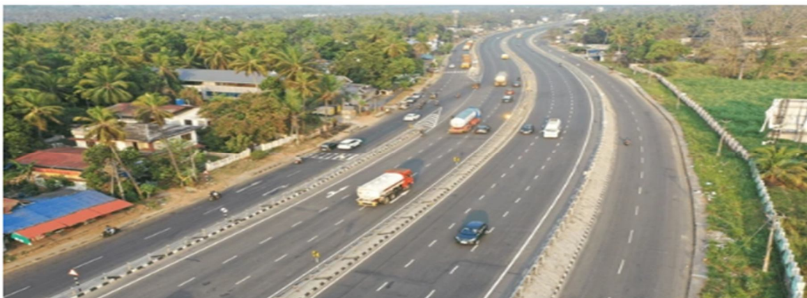
Fig 2: New Six Lane National Highway (NH-66) in Kerala