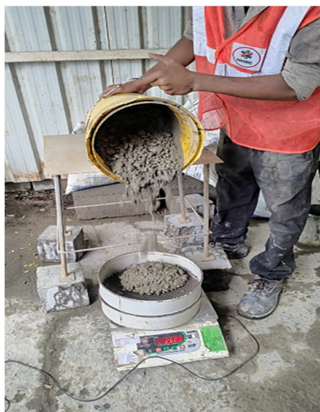
Fig 5. Sieve Segregation resistance Test

Comparison of fresh concrete and hardened concrete tests of concrete trial mix no - TR 1& TR 2 revealed that there was large difference in the test values of both fresh and hardened concrete for the two mixes; and this may be due to improvement in pore structure and pore size due to use of UFGGBS (Alccofine 1203) and crystalline waterproofing chemical admixture.