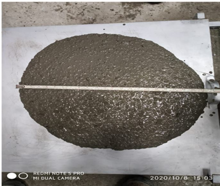
Fig.1 Slump Flow Test

“Self-compacting concrete is able to flow under its self-weight without segregation, bleeding without vibration and these behaviors of concrete can be ensured by Flowability tests, and Sieve segregation resistance tests of concrete to determine the flowability, passing ability, and segregation resistance of Self -compacting concrete according to BS: EN 12350 Part 8, 9, 10, 11, and 12” [14]