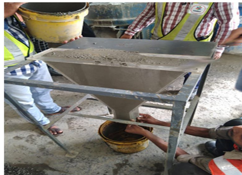
Fig.2 Funnel test