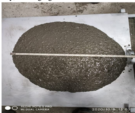
Fig.1 Slump Flow Test

“Self-compacting concrete is able to flow under its self-weight without segregation, bleeding without vibration and these behaviors of concrete can be ensured by Flowability tests, and Sieve segregation resistance tests of concrete to determine the flowability, passing ability, and segregation resistance of Self -compacting concrete according to BS: EN 12350 Part 8, 9, 10, 11, and 12” [14]