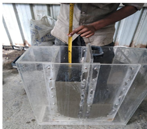
Fig 4. U- Box Test