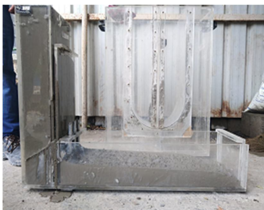
Fig 3. L-Box test