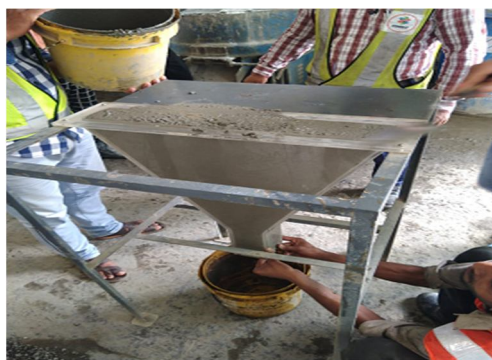
Fig.2 Funnel test