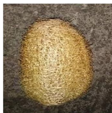
(a) Dried sponge gourd. (b) Sponge gourd without outer(c) Short luffa fibers