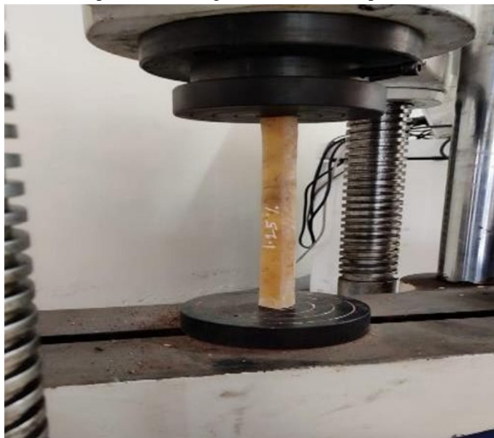
Fig. 5.3 Flat Sample Placed in the UTM for Compressive Test

Compressive test was carried out on a computerized UTM (Universal Testing Machine). The samples of dimension 200 mm * 15 mm * 15 mm were placed between the two test surfaces of the machine. At the point of breakage of the sample the values of compressive strength were shown on the computer screen. Fig. 5.3 shows the sample loaded in the UTM for compressive testing.