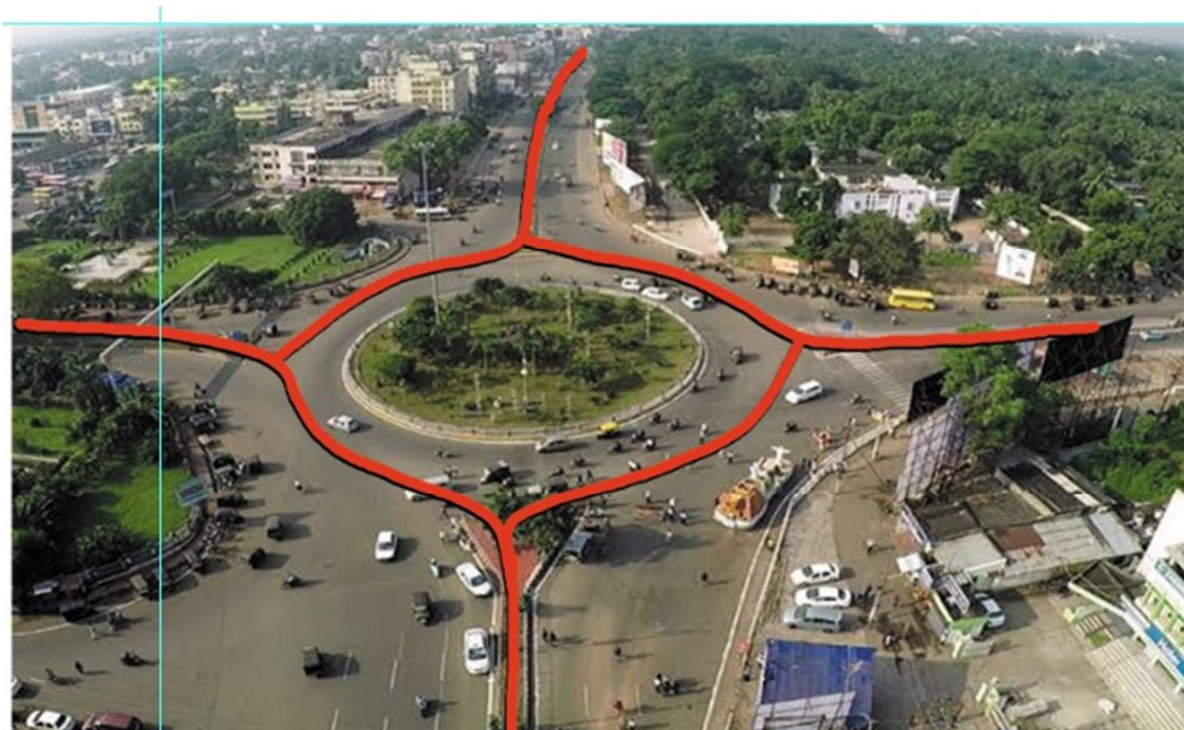
Figure 4 showing Circular Ring Patterns on Bhubaneswar Roads.

FOOT OVERBRIDGE ON BOTH THE ENDS OF THE ROW CONNECTING THE METRO NEO PATH