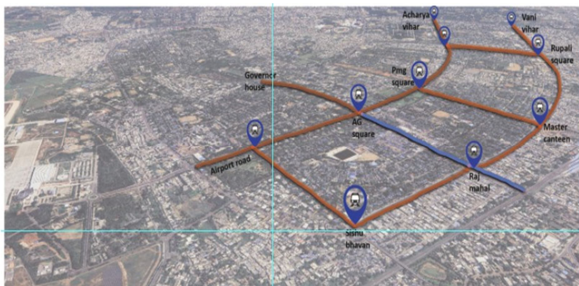
Figure 2 showing Bhubaneswar and identified study zones.

ROUTE A -SHOWING THE 12 NO OF PROPOSED STATION AT TOTAL STRETCH OF 15KM