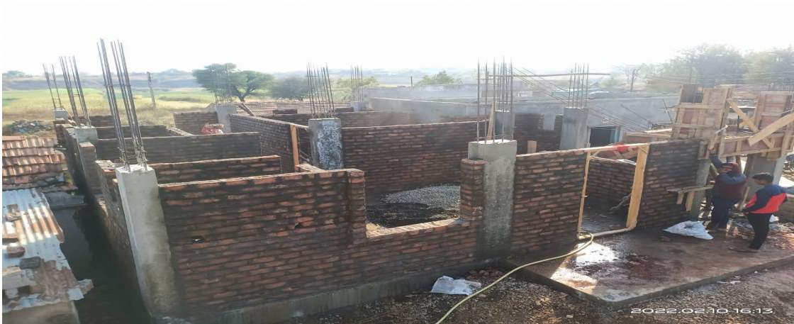
Site for casting mould