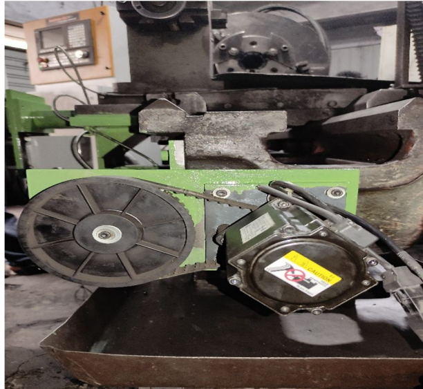
Fig. Servo Motor and Pulley

There are numbers of software available which can mimic the process involved in our research work and can produce the possible result. One of such type of software is Auto CAD, Ansys. We have using delta CNC software for creating a program for specific operation with the help of G-code and M-code, you can get program of G & M codes from online of our project and it eases the process of paper writing.