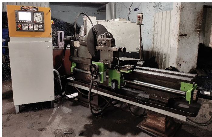
Fig. Modified CNC Lathe Machine