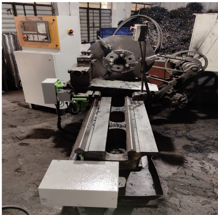
Fig. Lathe Bed of Modified Lathe Machine