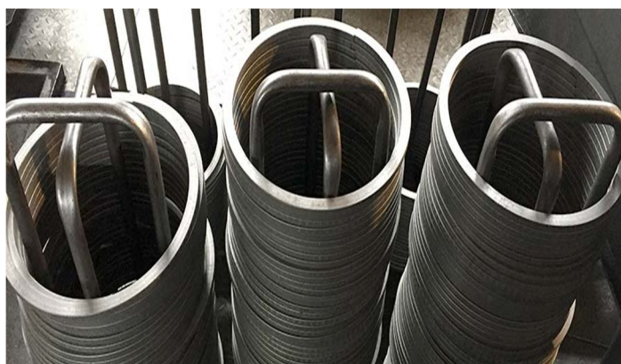
Fig. Machined Rings for Ring Gear