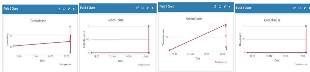
Fig 4: Results displayed on thingspeak platform