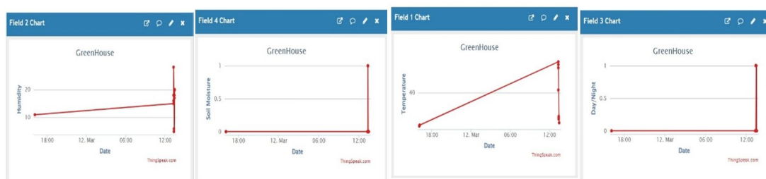
Fig 4: Results displayed on thingspeak platform