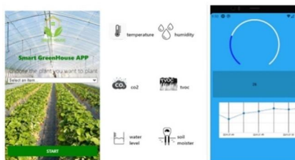
Fig 3: Designed App

The greenhouse monitoring and control system was conducted and the system demonstrated accurate and reliable monitoring of temperature, humidity, light intensity, and soil moisture levels. The implemented control algorithms effectively regulated environmental conditions within predefined thresholds, ensuring optimal growth conditions for the cultivated plants. Remote monitoring capabilities enabled greenhouse operators to access real-time data and control settings from anywhere, thereby enhancing operational efficiency and convenience. Furthermore, the system's low-power consumption and energy-efficient design contribute to sustainability and cost-effectiveness in greenhouse operations.