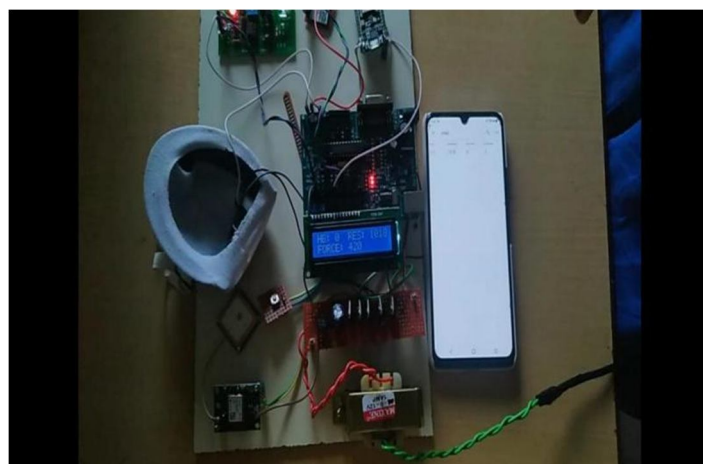
(b) Design Of Proposed System