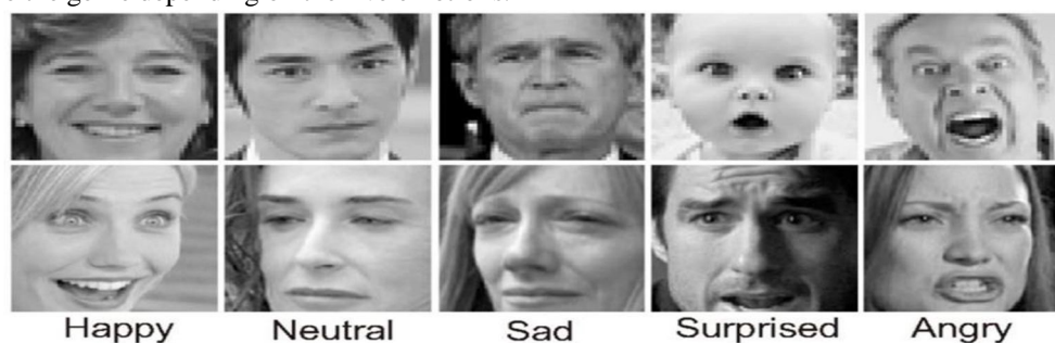
Fig 4: FER 2013 image samples