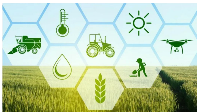
Fig. 1. Overview and Scopes