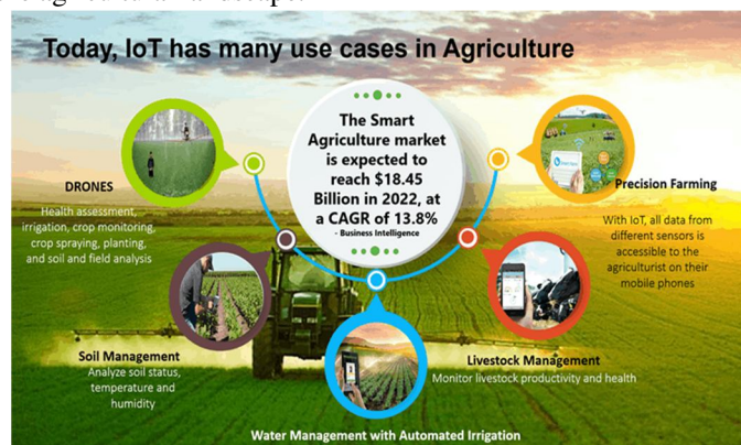
Fig. 4. Driven Precision Agriculture

To establish and nurture an online community focused on "Navigating the Agricultural Land- scape," we will employ various engagement strategies and cultivate relationships within the agricultural sector. This en- tails creating avenues for user interaction, such as comment sections, discussion forums, polls, and opportunities for user- generated content. These initiatives will not only foster a sense of community but also provide valuable insights into the needs and preferences of our audience. Moreover, we will actively seek partnerships with influencers, thought leaders, and key stakeholders in the agricultural industry to enhance our credibility and broaden our reach. By collaborating with respected figures and organizations, we can leverage their expertise and networks to amplify our message and build trust within the community. Transparency, authenticity, and responsiveness will be prioritized in our interactions with the community, ensuring that we actively listen to feedback, address concerns openly, and demonstrate our commitment to serving the interests of farmers and agricultural professionals. Through these efforts, we aim to create an inclusive and supportive online community that facilitates learning, collabo- ration, and the exchange of knowledge and experiences related to navigating the agricultural landscape.