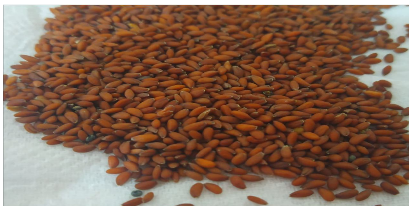
Image no. 1 Garden cress seeds