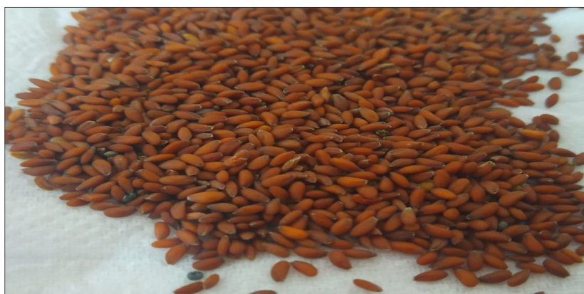
Image no. 1 Garden cress seeds