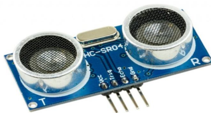
Fig. 2 Ultrasonic Sensor (HC-SR04)

To calculate the distance between the sensor and the object, the sensor measures the time taken between the emission of the sound by the transmitter to its contact with the receiver. Ultrasonic sensors are used firstly and commonly as proximity sensors. They can be found in an anti-collision safety systems and automobile self-parking technology. In comparison to Infrared sensors in proximity sensing applications, ultrasonic sensors are not as susceptible to interference of smoke, gas, and other airborne particles. Ultrasonic sensor is shown in Fig. 2.