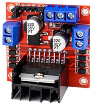
Fig. 3 Motor Driver (L298N)

A motor driver is an integrated circuit chip. It is mostly used to control motors in an autonomous robot. Motor driver IC act as an interface between the motors in robot and the microprocessors in the robot. L293 series such as L293D, L293NE etc. are the most commonly used motor drivers. These motor drivers are designed to control two DC motors together. L293D consist of two H-bridge. H-bridge is the simplest of all circuits for controlling a low current rated motor. The L293D IC receives signals from the microprocessor and transmits relative signal to the motors. It has two voltage pins, one of which is used to apply voltage to the motors and the other is used to draw current for the working of the L293D. Motor Driver IC is shown in Fig. 3.