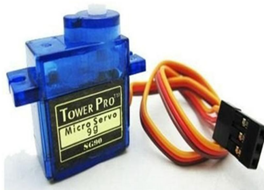
Fig. 4 Servo Motor (Tower Pro SG90)

A servomotor is a linear actuator or a rotary actuator that allows for accurate control of linear or angular position, acceleration and velocity. It consists of a sensor coupled with motor for position feedback. It also requires a relatively sophisticated controller, designed specifically for use with servomotors. The servo motor is a simple DC motor. With the help of servomechanism, it is controlled for specific angular rotation. Now-a-days, servo motors are widely used in many industrial applications. In the obstacle avoiding robot, it is used for rotating the ultrasonic sensors. Whenever any obstacle comes in front of it, the robot detects it and stops and then after that servo motor rotates in both left and right directions. Along with the servo motor, the ultrasonic sensor which is mounted on it also rotates. Servo Motor is shown in Fig. 4.