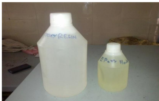
Fig 2: Epoxy resin and hardener