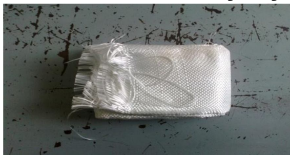
Fig 1: E-glass fiber

The commonly used fibers are carbon, glass, Kevlar, etc. Among these, the glass fiber has been selected as the core leaf based on the cost factor and strength and the carbon fiber is selected as the laminate over the core leaf. The types of glass fibers are C-glass, S-glass and E-glass. The C-glass fiber is designed to give improved surface finish. S-glass fiber is design to give very high modular, which is used particularly in aeronautic industries. The E-glass fiber is a high quality glass, which is used as standard reinforcement fiber for all the present systems well complying with mechanical property requirements. Thus, E-glass fiber was found appropriate for this application. And for carbon fiber there are several type of fibers based on properties, on precursors and on heat treatment temperature. After a long analysis and study TYPE II intermediate heat treatment carbon fiber is taken, where final heat treatment temperature should be around 1500 degrees Celsius and can be associated with high strength type fiber.