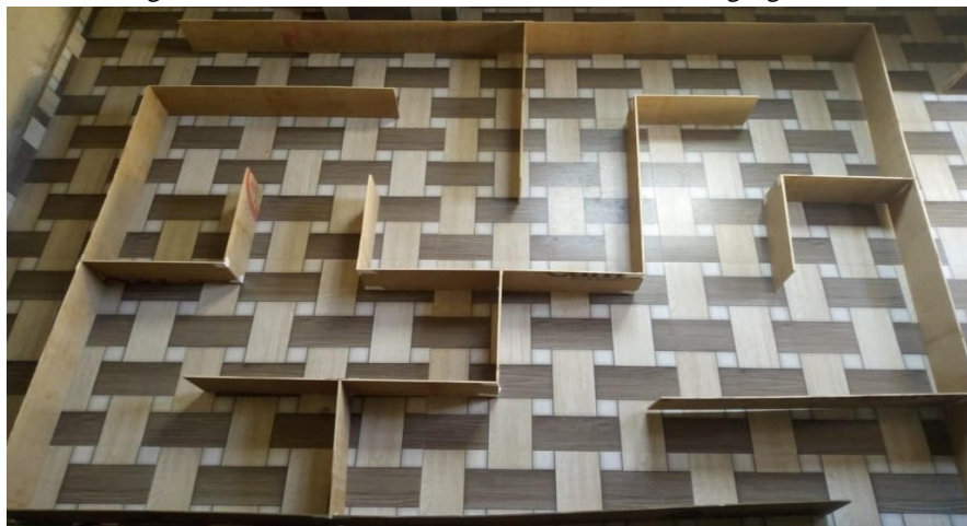
Fig – Maize

Build maize by using cardboards. It will be baseless maize. The distance between two walls will be 20 cm which is suitable for robot motion through maize. The height of the maize wall will be 15 cm. The following figure shows the architecture of the maize.