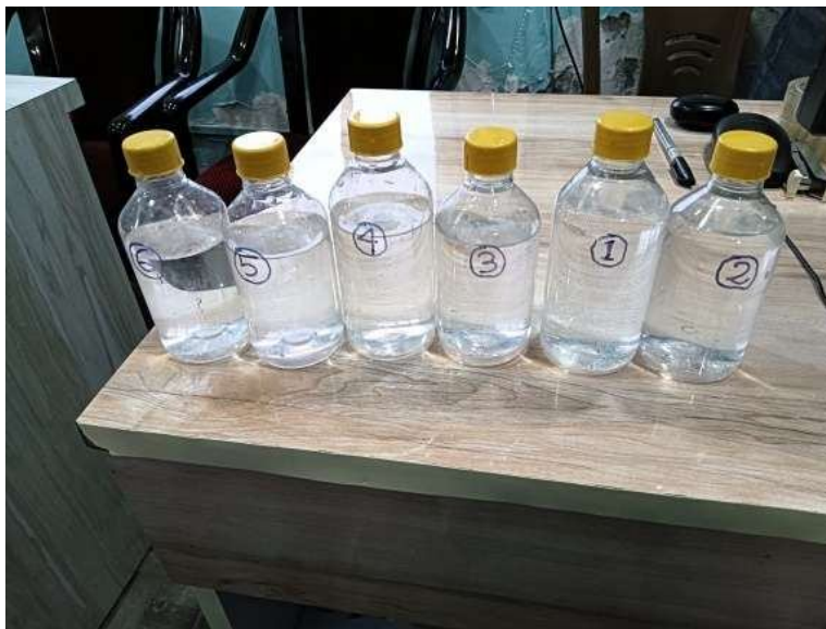
Fig. 3 Water sampling

Groundwater samples were collected from a tube well in Nadia District. Raw and filtered water samples were analyzed for iron concentration and other physical and chemical parameters, including colour, turbidity, pH, total suspended solids (TSS), total dissolved solids (TDS), total alkalinity, total hardness, chloride, arsenic, and manganese. Analyses were conducted at the NABL-accredited Kalyani State Referral Laboratory, Public Health Engineering Directorate, West Bengal.