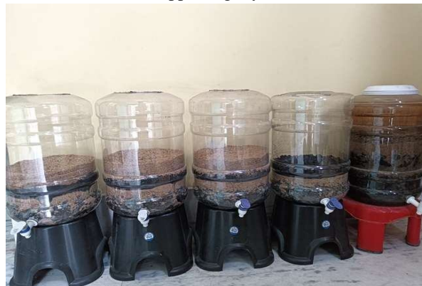
Fig. 2 Filtration units

Stone aggregates of 20 mm and 10 mm size were used as supporting layers.