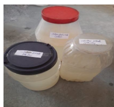
Fig. 4 Alkaline Liquid