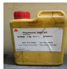
Fig. 6 Super Plasticizer