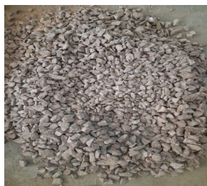
Fig. 2 Coarse Aggregate