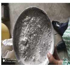
Fig. 5 GGBS