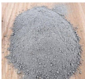
Fig. 1 Fly Ash