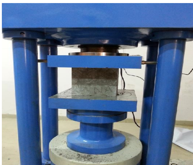
Fig. 7 Compressive Strength Test

Compressive strength test measuring the maximum amount of compressive load a material can bear before fracturing. The test piece was compressed between the platens of a compression-testing machine by a gradually applied load.