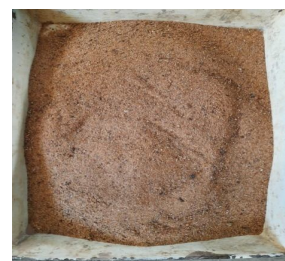
Fig. 3 Fine Aggregate