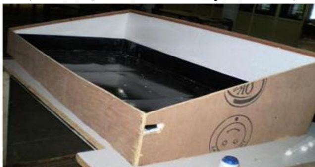
Figure.2 Side walls for Still

For better insulation we have used composite wall of thermocol (inside) and wood (outside). (Size:: wood( k = \text{thermal conductivity} = 0.6 \text{ W/m}^2\text{C} ):-- 8 mm thick, thermocol( k = \text{thermal conductivity} = 0.02 \text{ W/m}^2\text{C} ):-- 15 mm thick).