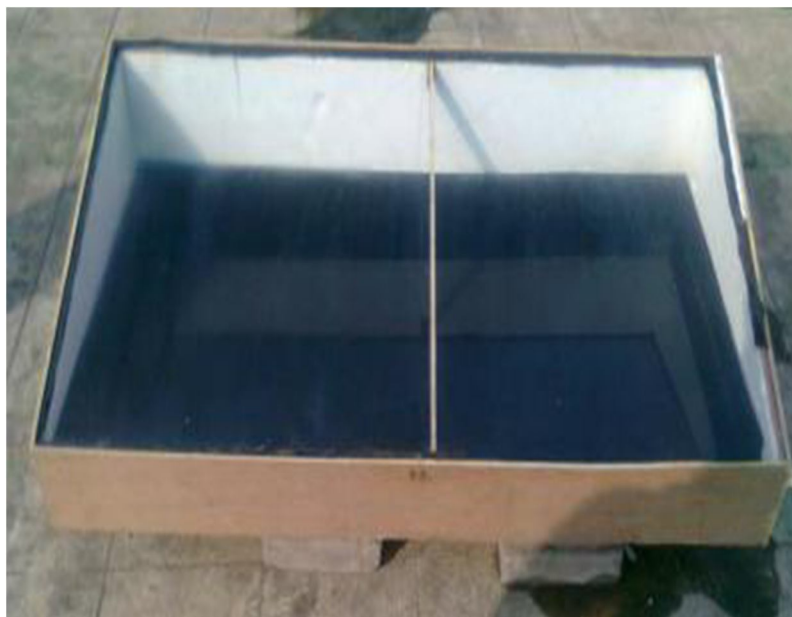
Figure.5 Working Model of Solar Distillation System

The only change in our model is that we have to make the model as vacuumed as possible. So we have tried to make it airtight by sticking tape on the corners of the glass and at the edges of the box from where the possibility of the leakage of inside hot air is maximum.