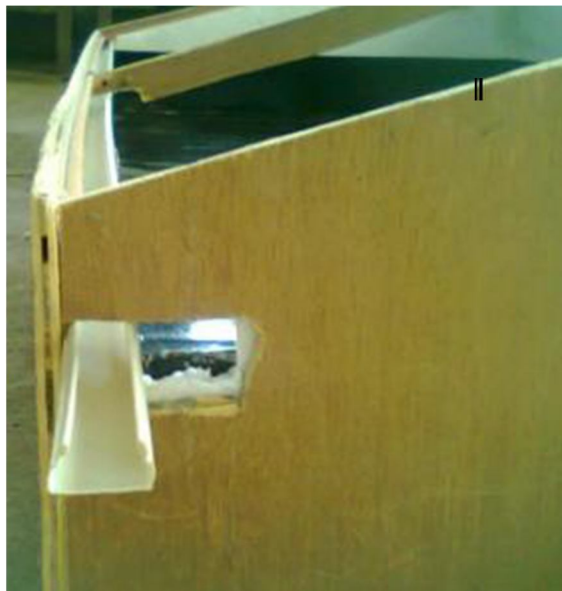
Figure.4 Solar Still Channel Design

We have used P.V.C channel (figure.4)(size:: 4.5' X 1" cm).