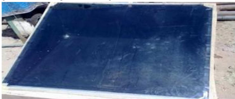
Figure.3 Solar Still Glass with Cover

We have used glass (3mm) (figure 3) thick as top cover having rubber tube as frame border. (size: ---- 4' x 2' cm).