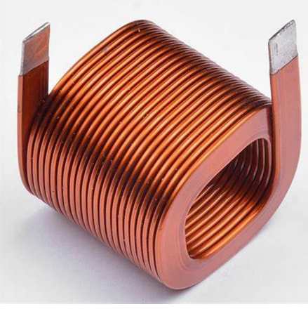
Figure 3 copper coil