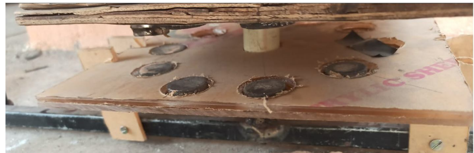
Figure 2 arrangement of both planes holding magnets within 4cm apart

2) Neodymium Magnets: Neodymium magnets are used in this maglev turbine. Neodymium magnets are permanent magnet made from an alloy of neodymium, iron, and boron. Neodymium magnets of 30mm diameter and a height of 5mm. It has a magnetic flux of 1913 gauss and a pull force of 9.8kgs. We are using 20 such magnets to create levitation effect. These 20 magnets are arranged in circular order from the shaft on both upper and lower plane with same poles facing each other. The distance between these planes are 4cm.