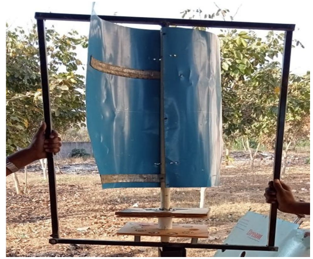
Figure 4 Working Model Maglev wind turbine

Fabricated a working model Maglev wind turbine and done various tests on it's performance under different wind speeds and number of turns in coil.