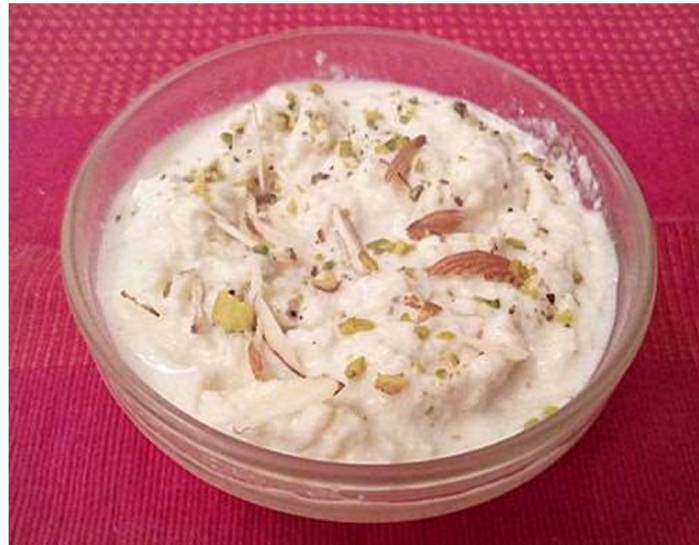
Fig2. sensory analysis of Pista Rabdi