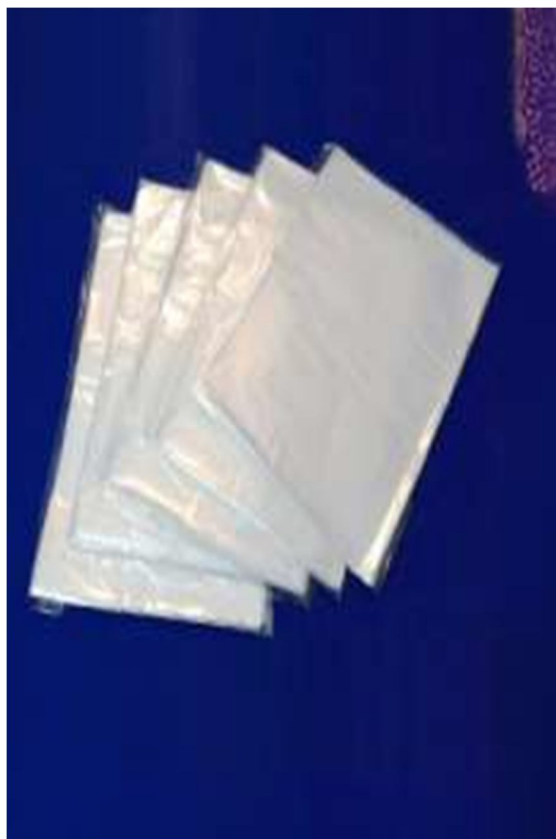
Fig 4: LDPE Packaging Material

It's a soft, flexible, lightweight plastic material, noted for its low temperature flexibility, toughness, and corrosion resistance. This allows the consumer to have a greater experience in seeing the contents and product level as well as holding and squeezing the packaging.