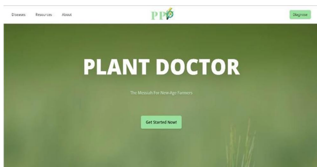
Fig1. Home page.