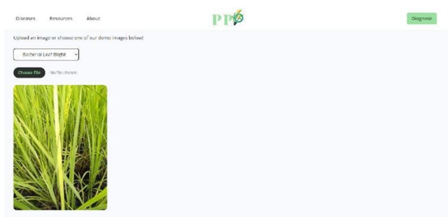
Fig3. Uploading a stock image.