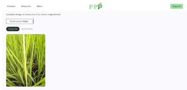
Fig3. Uploading a stock image.