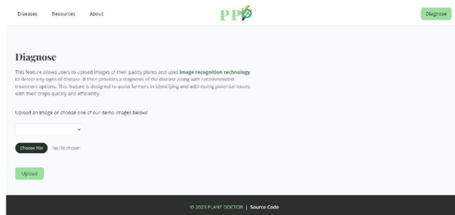
Fig2. Diagnose page.