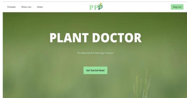
Fig1. Home page.