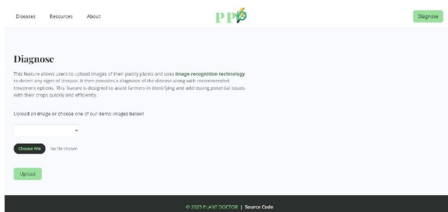
Fig2. Diagnose page.