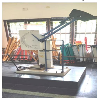
Fig 6: Impact testing machine

Impact strength, is the capability of the material to withstand a suddenly applied load and is expressed in terms of energy. Often measured with the Izod impact strength test or Charpy impact test. Low velocity instrumented impact tests are carried out on composite specimens. The tests are done as per ASTM D256 using an impact tester. The Charpy/Izod impact testing machine ascertains the notch impact strength of the material by shattering the V-notched specimen with a pendulum hammer, measuring the spent energy, and relating it to the cross section of the specimen