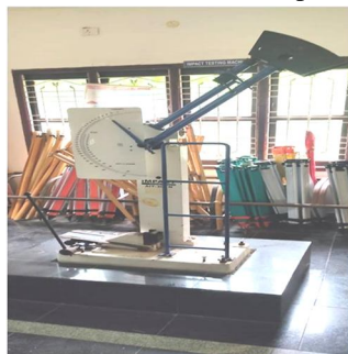
Fig 6: Impact testing machine

Impact strength, is the capability of the material to withstand a suddenly applied load and is expressed in terms of energy. Often measured with the Izod impact strength test or Charpy impact test. Low velocity instrumented impact tests are carried out on composite specimens. The tests are done as per ASTM D256 using an impact tester. The Charpy/Izod impact testing machine ascertains the notch impact strength of the material by shattering the V-notched specimen with a pendulum hammer, measuring the spent energy, and relating it to the cross section of the specimen