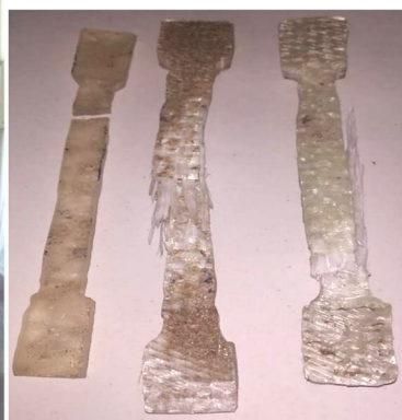
Fig 7: Specimens after Tensile Test