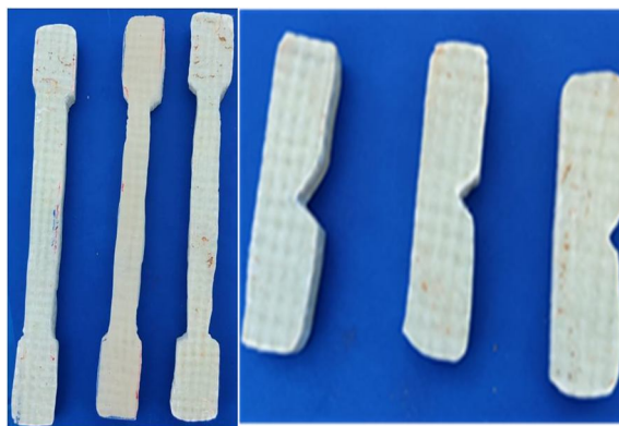
Fig 4: Resin and E-glass fiber Specimens for Tensile and Impact tests