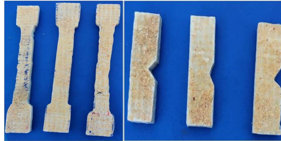
Fig 5: Resin, E-glass fiber and Fly-ash Specimens for Tensile and Impact tests