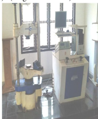
Fig 6: UTM machine