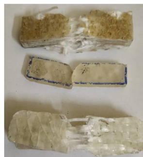
Fig 7: Specimens after Impact Test