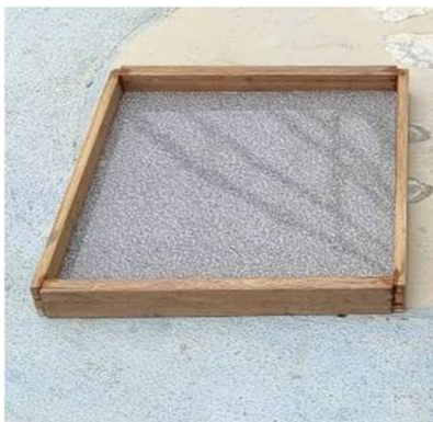
Fig 2: Preparation of Mould

In this process three moulds are to be prepared. Each mould is prepared by using tile and wood material. Each mould of 300mm×300mm in size, and thickness of 5mm should be prepared. After preparation of mould a release oil (grease) is to be applied to all moulds for quick and easy removal of specimen without any damage. A release sheet (mat) is also placed on the tile, so that it reduces the sticky nature between resin and mould.