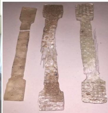
Fig 7: Specimens after Tensile Test