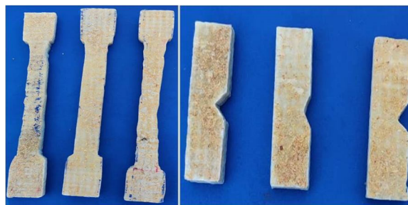
Fig 5: Resin, E-glass fiber and Fly-ash Specimens for Tensile and Impact tests