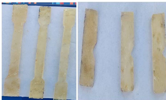
Fig 3: Resin Specimen for Tensile and Impact tests specimen

Wire hacksaw blade was used to cut each laminate into smaller pieces, for various experiments. tensile test- sample was cut into dog bone shape as per ASTM D-638(tensile), impact test- sample was cut into flat shape with notch at centre as per ASTM D-256(impact)