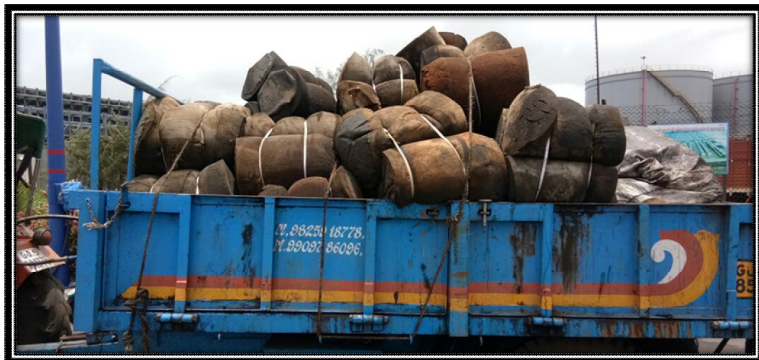
Fig.5. USED PIG.