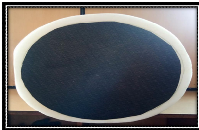
Fig.4. PIG foam