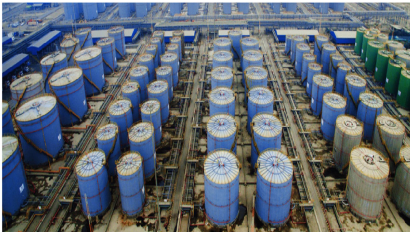
Figure 1. LIQUID TANK