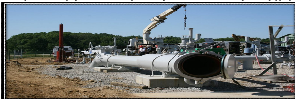
Figure 2. Pigging Pipeline

It mostly used for cleaning and batching operation, following are the operation and reason to implement pigging.