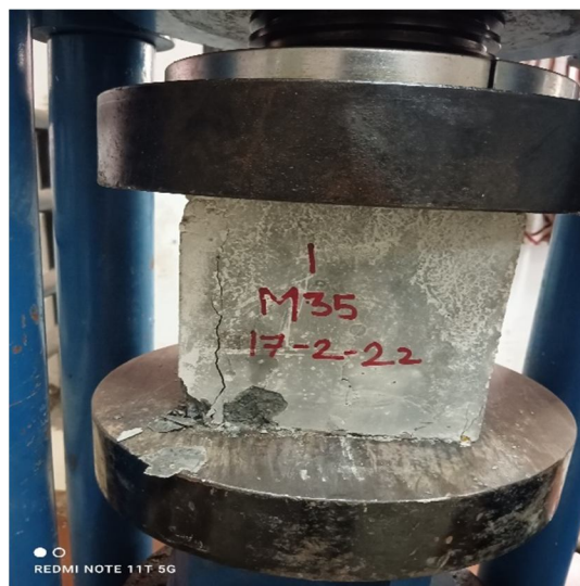
Figure 3. Compressive Strength Test