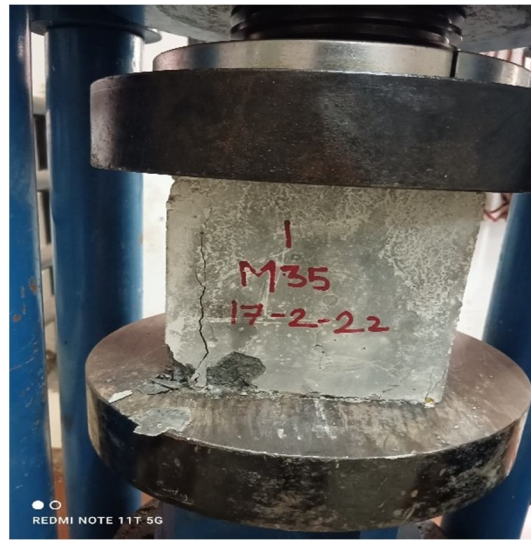
Figure 3. Compressive Strength Test