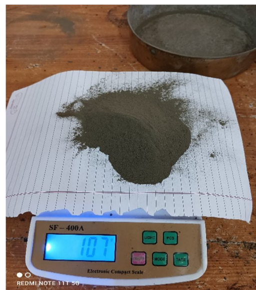
Figure 2. Fractions smaller than 120microns.