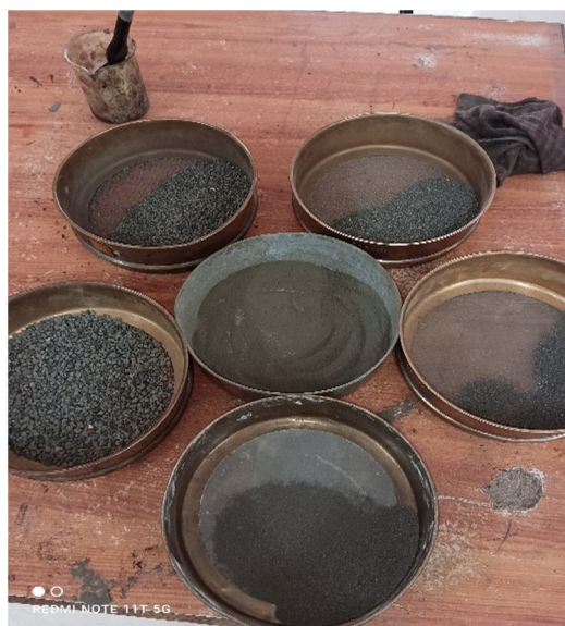
Figure 1. Sieving of Fine Aggregates