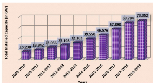
FIGURE 1. Growth of renewable energy over the past decade in India