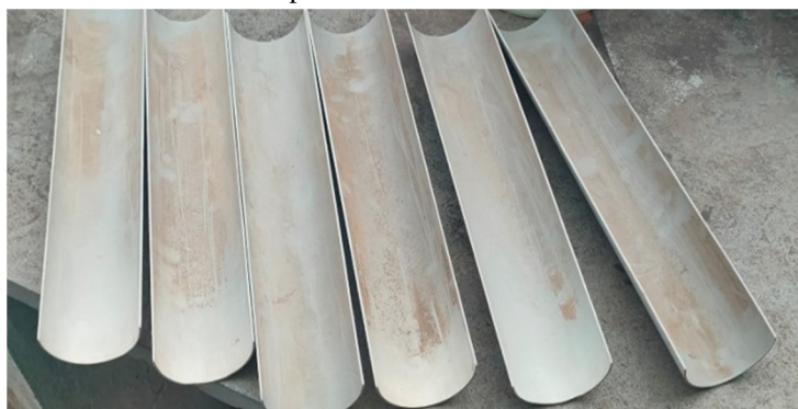
Fig. 6 Blades

The purpose of blades in a vertical axis wind turbine is to capture the energy from the wind and convert it into rotational motion, which can be used to generate electricity. The blades are designed to be aerodynamically efficient and are typically curved or twisted to optimize their performance. They are mounted on a vertical axis, which allows the turbine to capture wind from any direction, making it suitable for use in urban or confined spaces where the wind direction is variable