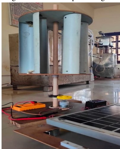
Fig. 9 Final image of the project

By calculating the output electrical energy of the vertical axis wind turbine and solar energy through trial runs, we concluded that the power generated by the wind turbine and solar panel is sufficient to provide continuous electrical supply without voltage fluctuations and can be easily handled, and the range of 6 to 8 blades provides greater efficiency for generating power.