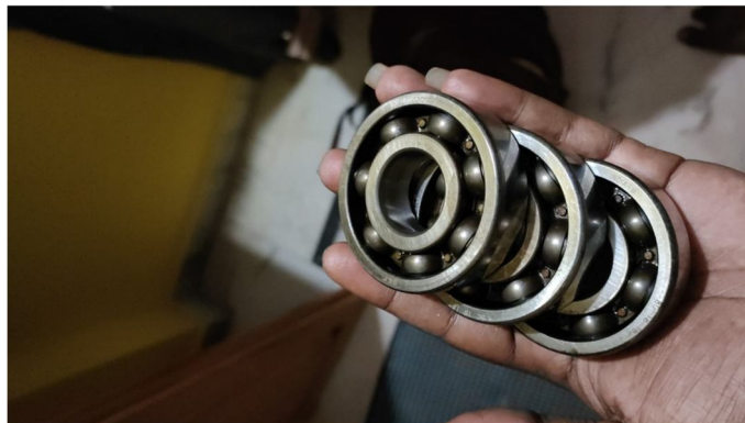
Fig. 7 Ball bearings

The ball bearing used to rotate the shaft freely without any disturbance which reduces the friction and the bearing fixed to bottom of the disc.