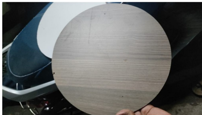
Fig. 8 Wooden discs

The wooden disc are used to hold the blades. Blades are clamped to the both bottom and top of the discs. Disc thickness is 1/4 and height of the disc in 12inches.