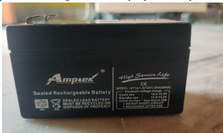
Fig. 5 Battery

The battery is used to store the power from the charge controller the capacity of the battery is used 12v 1.3AH DC