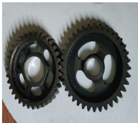
Fig. 3 Spur gears

Spur gears are used to transfer the motion and power from shaft to another mechanical setup. So, it can alter the speed and multiply torque. The two spur gears are placed at the bottom on the disc.