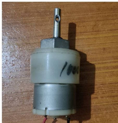
Fig. 2 DC motor

The capacity of dc motor is 12v with maximum speed of 1000 RPM. The dc motor converts the mechanical energy into electrical energy from the kinematic energy of the wind. When wind strikes the blade, the rotor rotates, and dc motor rotates.