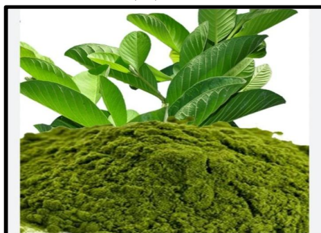
Fig: Guava leaves powder