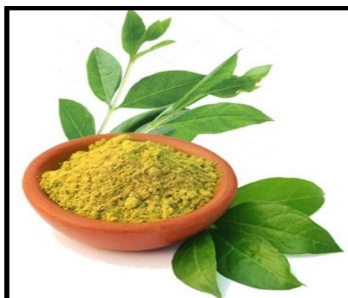
Fig: Henna powder