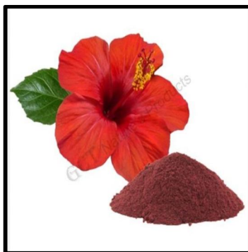
Fig: Hibiscus powder