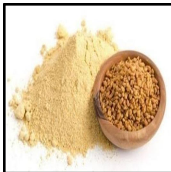
Fig: Fenugreek powder