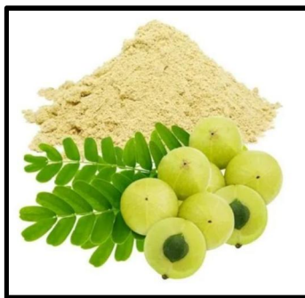
Fig: Amla Powder