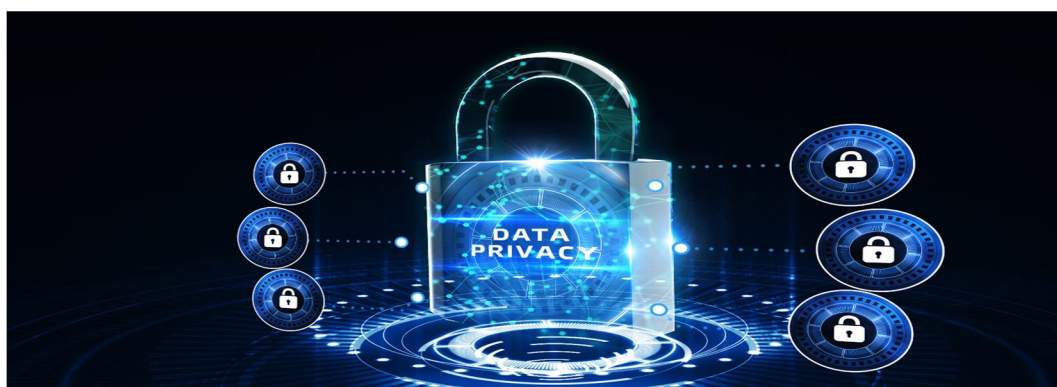
Figure 1 Data privacy

Abstract: Third-party cookies are essential for personalizing user experiences as online tracking and targeted advertising continue to advance quickly. But large-scale data collection by outside services also presents serious privacy risks that need to be looked into [1]. The present study examines various aspects of privacy degradation resulting from the widespread use of third-party cookies, which retain user data without explicit consent [2] We specifically draw attention to new issues with cross-site tracking, security threats from combined user profiles [3], manipulating user perception through persuasion, and conflicts of interest resulting from ambiguous data sharing contracts between platforms and advertisers.