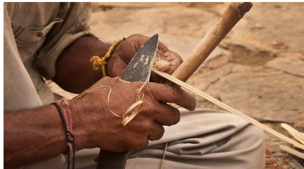
Fig. Cut the slivers into fine layers

The above method is a traditional method of making bamboo thin strips, which is time-consuming and has a chance of causing accidents as the operator uses a tool (cutter knife) by hand. That is the main reason for developing this design of bamboo strip making machine, as it will be the extension of our previously developed bamboo mat weaving machine. During the research, we found some references which are previous works on bamboo processing. There is a huge market where the bamboo is processed for a wide range of bamboo products, and China is one of the top countries that has a wide range and variety of bamboo products.