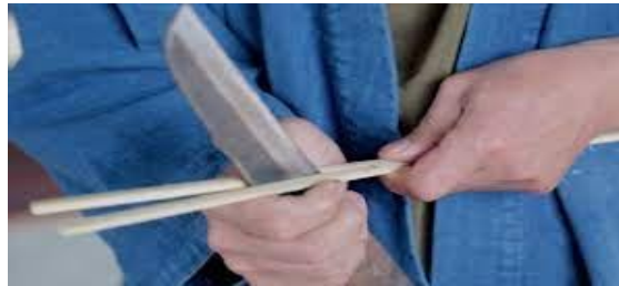
Fig. Separate the Sliver.