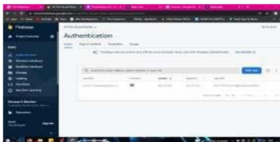
Figure: Page at the backend