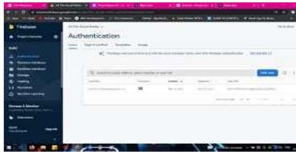
Figure: Page at the backend