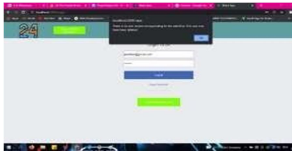
Figure: Wrong Credentials