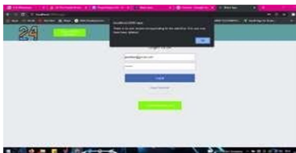
Figure: Wrong Credentials