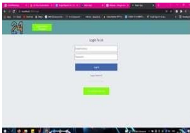
Figure: 24 Social Media Application