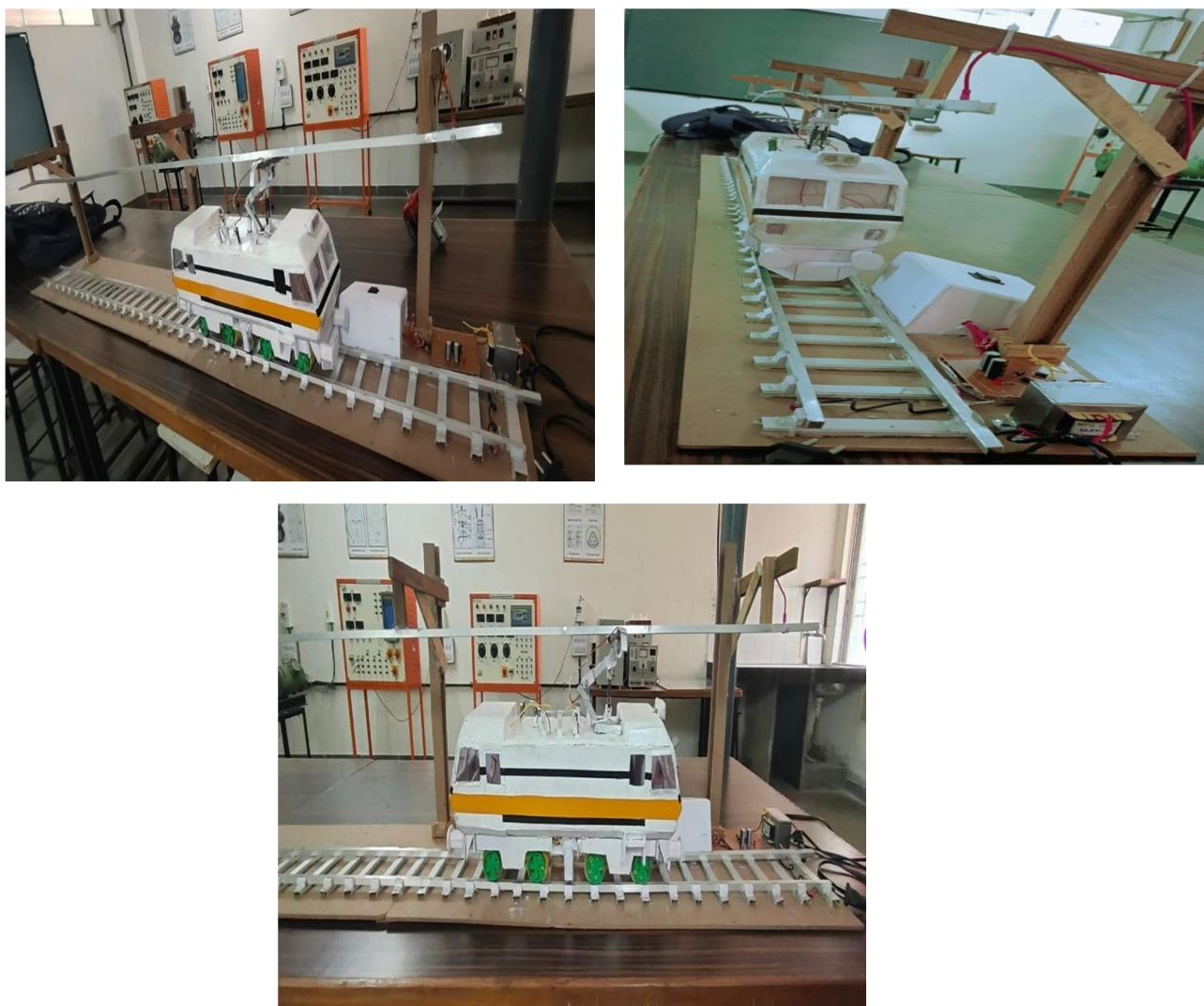
Fig.3 Hardware Implementation

The locomotive receives energy through overhead cables carrying AC (alternating current). The power station that generated the necessary electricity is where these wires are attached. The pantograph, which touches the overhead line and collects electricity, is powered by an alternating current that is converted in the first stage by a transformer from 230 volts to 24 volts in the overhead line. A circuit breaker is used to protect the locomotive from short circuits and overloaded currents. A single-phase ac engine is converted, and the output current is transferred from the circuit breaker to a rectifier, where it is converted to direct current (DC). The DC is then used to control the traction motor connector to the wheel, which is powered by the traction motor.