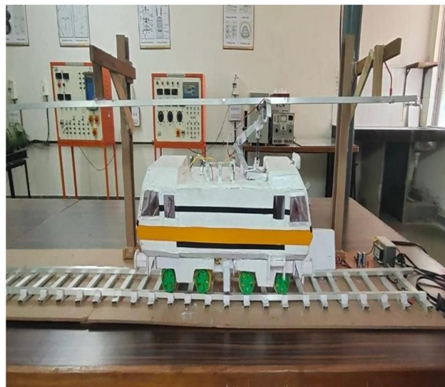
Fig.3 Hardware Implementation