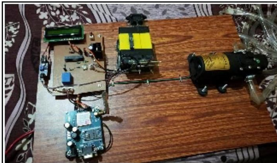
Fig 2: Outcome of project