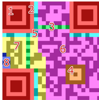
Figure 2: QR Code Structure

The entire QR code needs to be surrounded by the so-called Quiet Zone, an area the same color as white modules, to improve code identification by the decoder software.