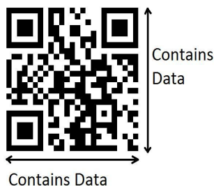
Figure 1: QR Code

In smartphones, QR codes are quite helpful and speed up work completion. You don't need to manually type the URL into your smartphone; you may open a website quickly merely by scanning a QR code. This is the reason that many website posters now have QR codes. One more common application is on a business card. In today's society, many now add QR codes to their business cards. Therefore, others can easily keep the contact information on their smartphone by scanning the QR code.