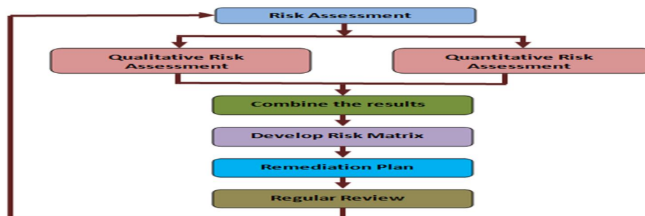
Figure 2: Integrated Information Security Risk Assessment Framework

We have developed an Integrated Information Security Risk Assessment Framework to identify and analyze security risk of organizations. We construct the risk matrix for information security during which we identify both qualitative and quantitative risks.