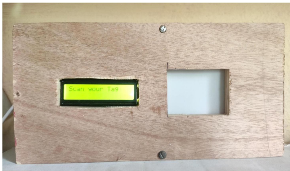
Figure 2: System Design