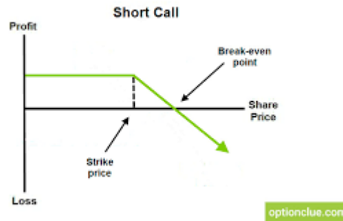
Fig 4: Short Position Call Option