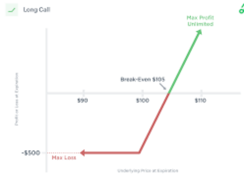
Fig 3: Long Position Call Option