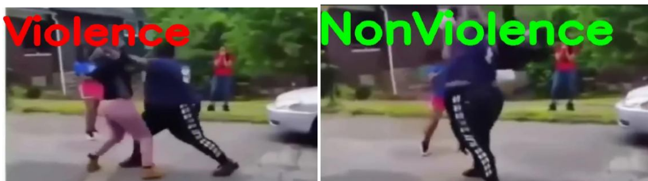
Fig 4: Violence and nonviolence detection from Video