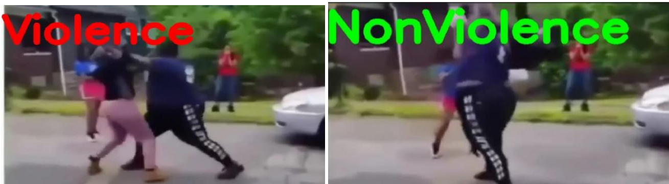
Fig 4: Violence and nonviolence detection from Video