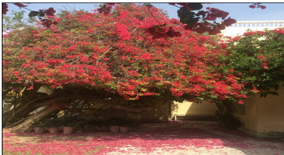
Fig. 2: Regeneration of Bougainvillea tree at 48 °C in summer, June 2020