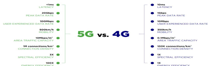
Figure: Difference between 5G and 4G