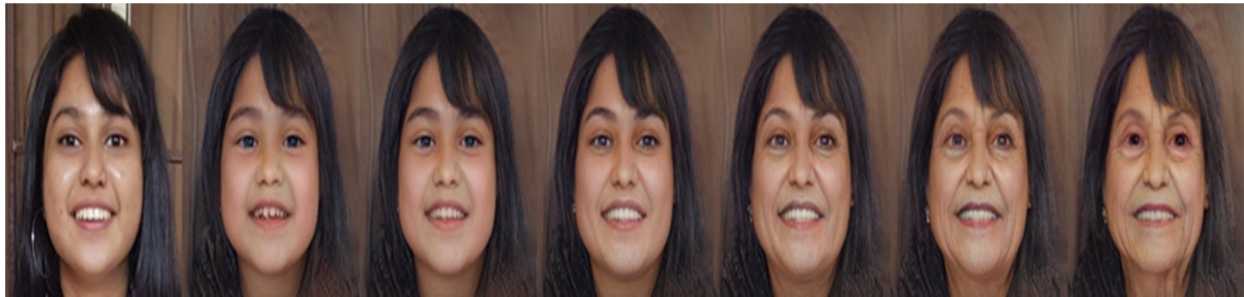
Figure 3: Aging results between the ages 0 and 100

This phase implements the use of a child face aging mechanism using Generative Adversarial Networks (GANs) to generate aged versions of a child's face based on their childhood pictures (Figure 3). The system is developed using programming languages such as Python, Tensorflow, Keras and Pytorch. The system's features, such as uploading pictures and providing information about missing children and the notification feature, is developed using Dart, Flutter, Firebase which resulted in an App named 'Reunite'. The development of the system follows the Agile methodology, with an iterative approach to incorporate feedback from stakeholders and users.