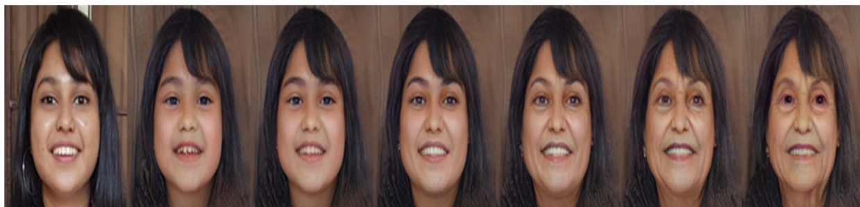
Figure 3: Aging results between the ages 0 and 100

This phase implements the use of a child face aging mechanism using Generative Adversarial Networks (GANs) to generate aged versions of a child's face based on their childhood pictures (Figure 3). The system is developed using programming languages such as Python, Tensorflow, Keras and Pytorch. The system's features, such as uploading pictures and providing information about missing children and the notification feature, is developed using Dart, Flutter, Firebase which resulted in an App named 'Reunite'. The development of the system follows the Agile methodology, with an iterative approach to incorporate feedback from stakeholders and users.