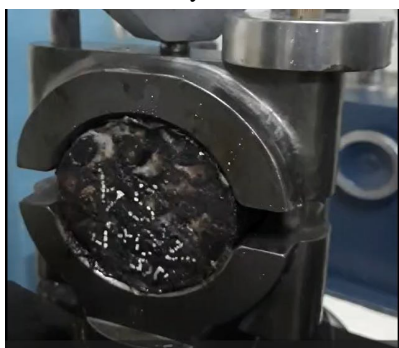
Figure 1: Marshall Stability test

Loading arrangement of Marshall Stability and ITS test is shown below: