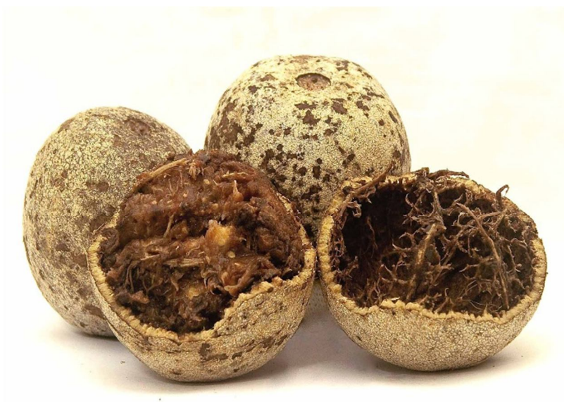
Fig: 1 Wood Apple