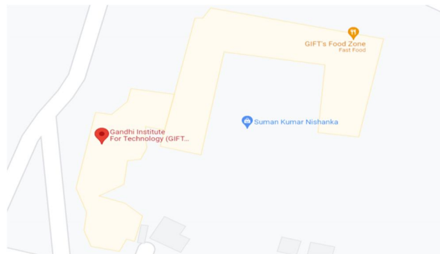
Fig. 4 Location map of study area of GIFT College.