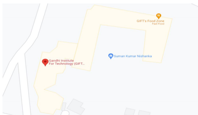
Fig. 4 Location map of study area of GIFT College.