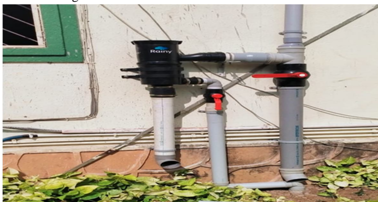
Fig. 2 Components of rooftop rainwater harvesting

Components of rooftop rainwater harvesting as shown in below